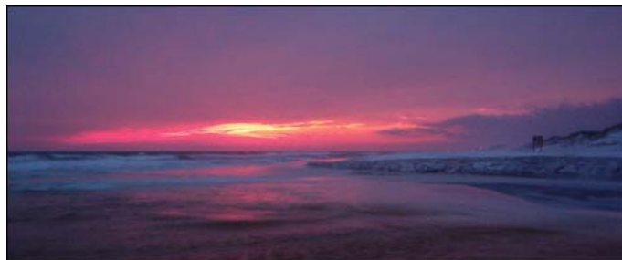
Stallworth Lake Outfall at Sunset

For more information, please visit the project website at http://dunelakes.org . The website offers a synopsis of the individual meetings and an opportunity to participate in our online discussion.