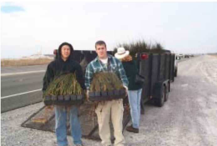
Choctawhatchee High Students Working to Re-vegetate Shoreline at Okaloosa Island

Non-Profit Org. U.S. Postage PAID Bulk Rate Permit #28 Niceville, FL